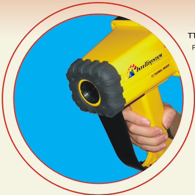
Handhold, easy operation

TT-G2F-HTI firefighting thermal imaging camera integrates 160x120 uncooled FPA detector. Featured with temperature measurement function and unique firefighting color scale, F2 has specifically designed to help firefighters to see through smoke, identify and quick locate targets in scene of fire.