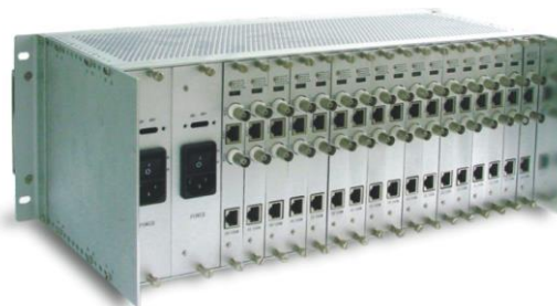
4U, 19 inch, 16 slots Rack