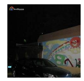
With white light