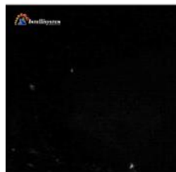
Without white light