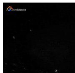
Without white light