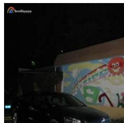
With white light